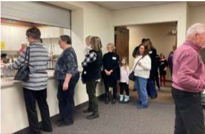
There was never a wait with all pancakes and sausages done by the time worship was out