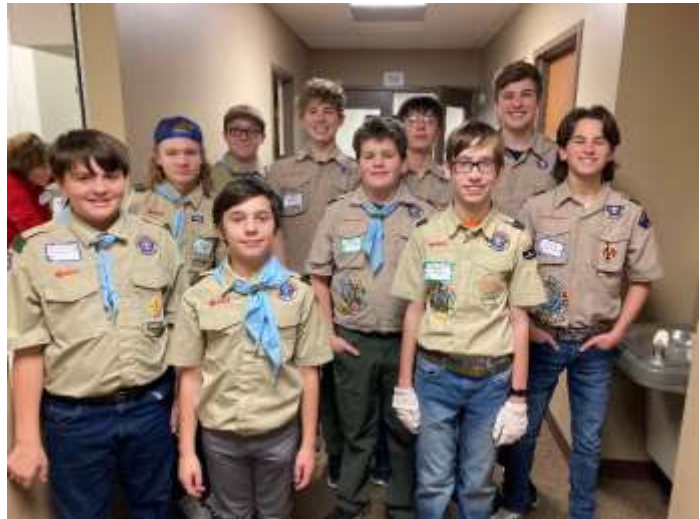
Ten fine Scouts from Troop 23 happily delivered wonderful service to the guests